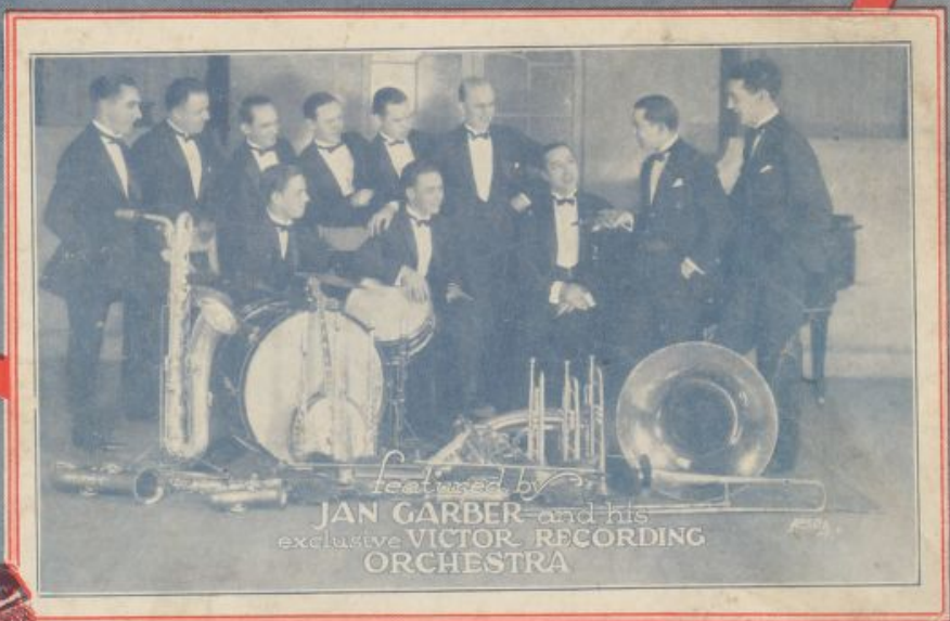
Featured by JAN GARBER and his exclusive VICTOR RECORDING ORCHESTRA

L. B. CURTIS MUSIC PUBLISHER 1595 - BROADWAY NEW YORK