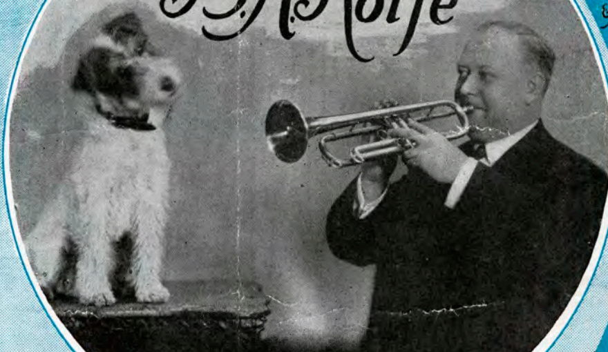
HIS SEVEREST CRITIC

WITH PIANO ARR. FOR FOUR HANDS ALSO UKULELE & BANJO UKE. Arrangement