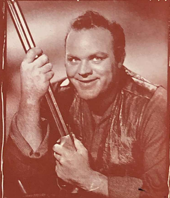
Dan Blocker as HOSS