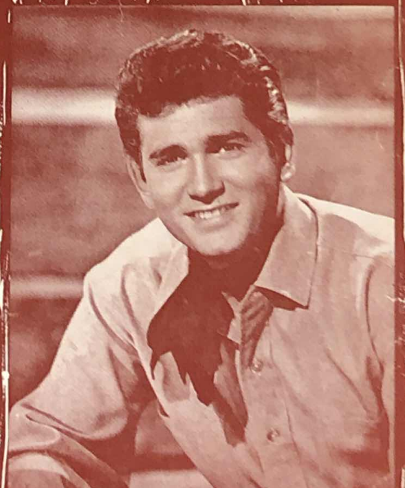
Michael Landon as LITTLE JOE