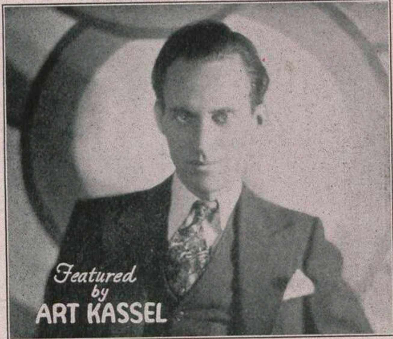
Featured by ART KASSEL