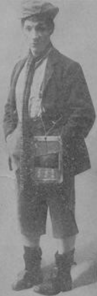
THE SAFTEST O' THE FAMILY.