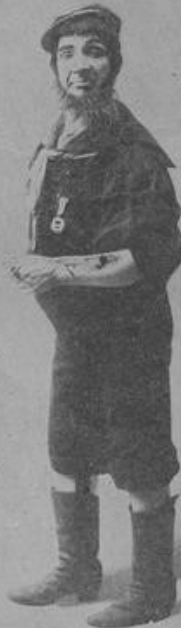
WE PARTED ON THE SHORE.