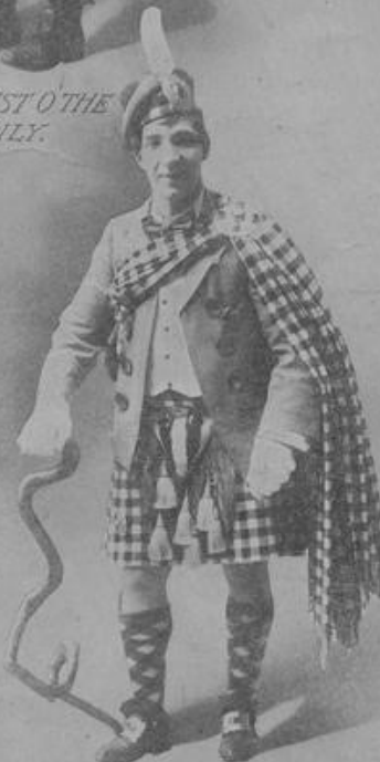
I LOVE A LASSIE.