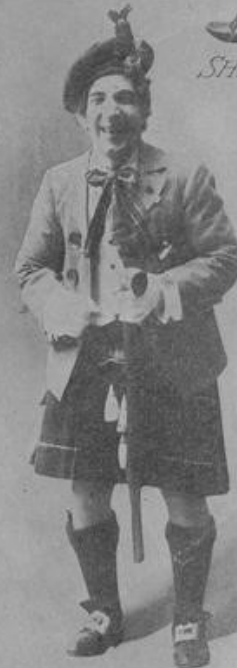
STOP YER TICKLING.

T. B. HARMS & FRANCIS DAY & HUNTER 1431-1433 BROADWAY NEW YORK