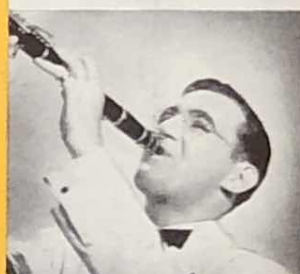
BENNY GOODMAN and his Orchestra