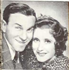
George BURNS and Gracie ALLEN

Words and Music by LEO ROBIN and RALPH RAINGER