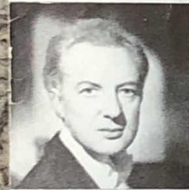
LEOPOLD STOKOWSKI & Symphony Orchestra