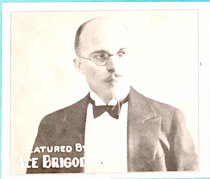
FEATURED BY ACE BRIGODE