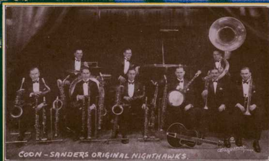
COON - SANDERS ORIGINAL NIGHTHAWKS.

Published by M.C. SCOTT TERRE HAUTE, IND.