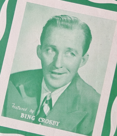
Featured by BING CROSBY

EDWIN H. MORRIS & COMPANY, INC. MUSIC PUBLISHERS By Arrangement With NATIONAL MUSIC PUBLISHING CORP.