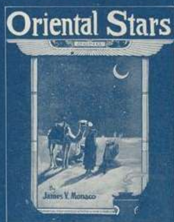
ONE STEP SONG