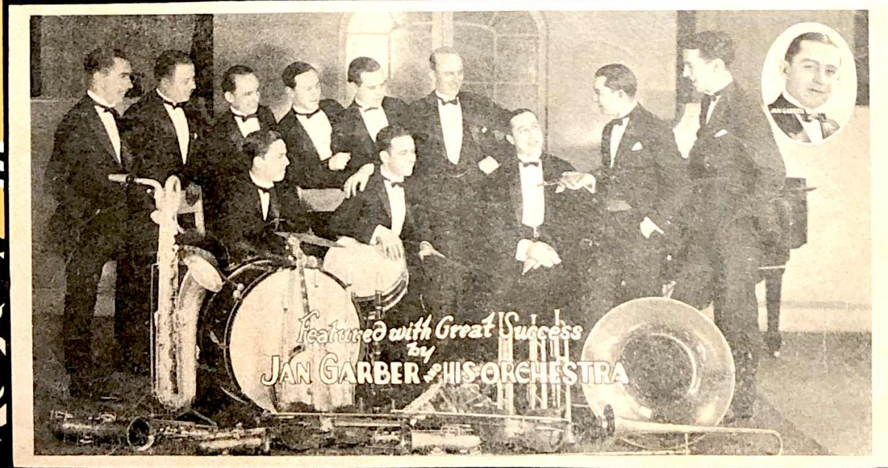
Featured with Great Success by JAN GARBER & HIS ORCHESTRA