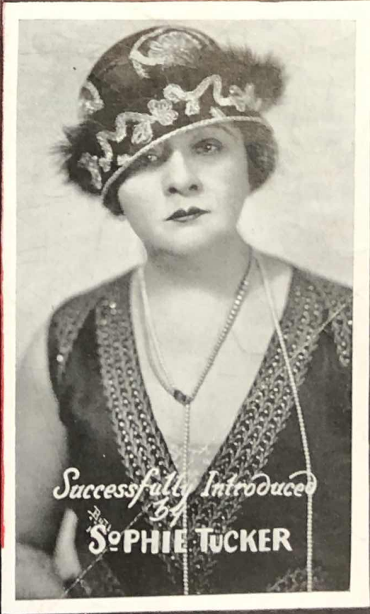
Successfully Introduced By SOPHIE TUCKER