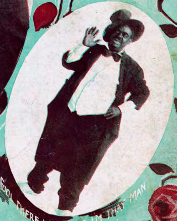
FOOL THERE WAS - AND I'M THAT MAN

J. FRED HELF COMPANY 136 WEST 37 th ST. N.Y. CITY Successor to HELF & HAGER COMPANY