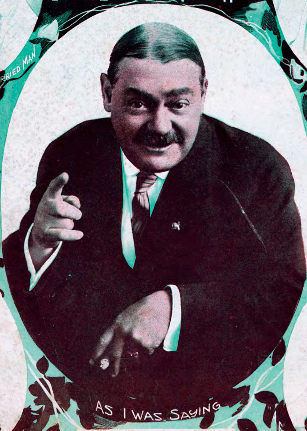
AS I WAS SAYING