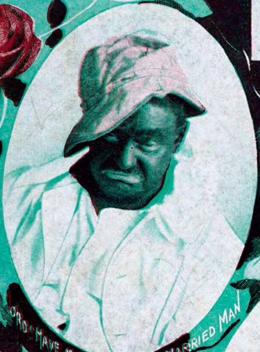
LORD! HAVE MERCY ON A MARRIED MAN