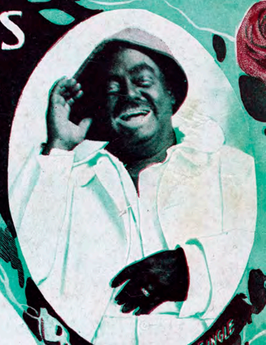
BLESS THE SINGLE