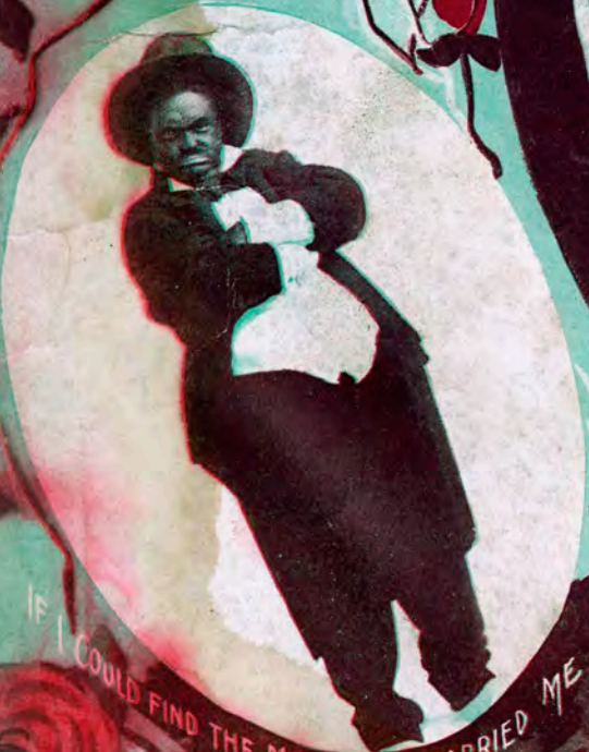
IF I COULD FIND THE MAN WHO MARRIED ME