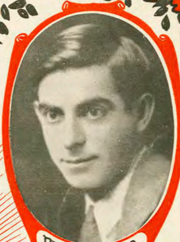
EDDIE CANTOR in "Kid Boots"