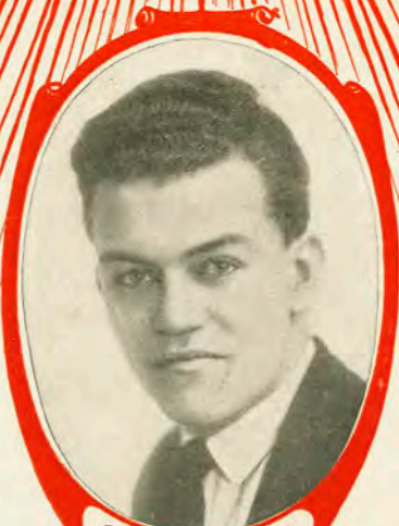
JAY C. FLIPPEN in "June Days."