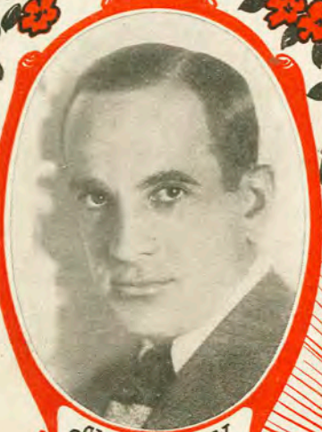
AL JOLSON in "Big Boy."