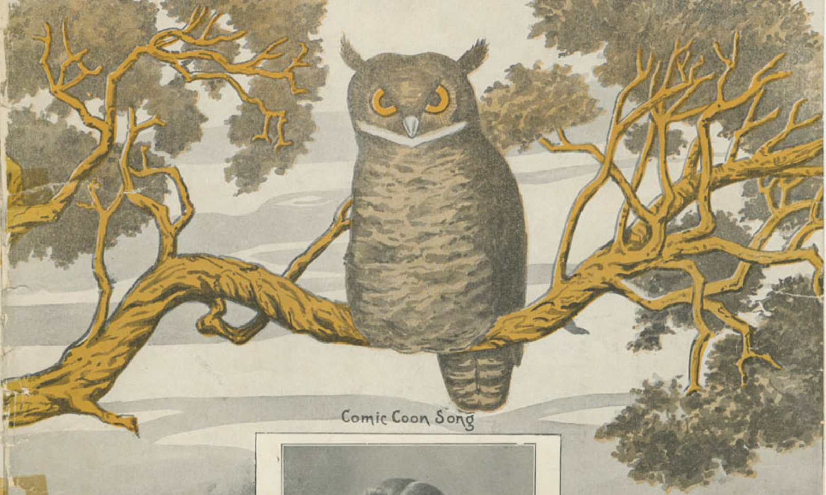
Comic Coon Song