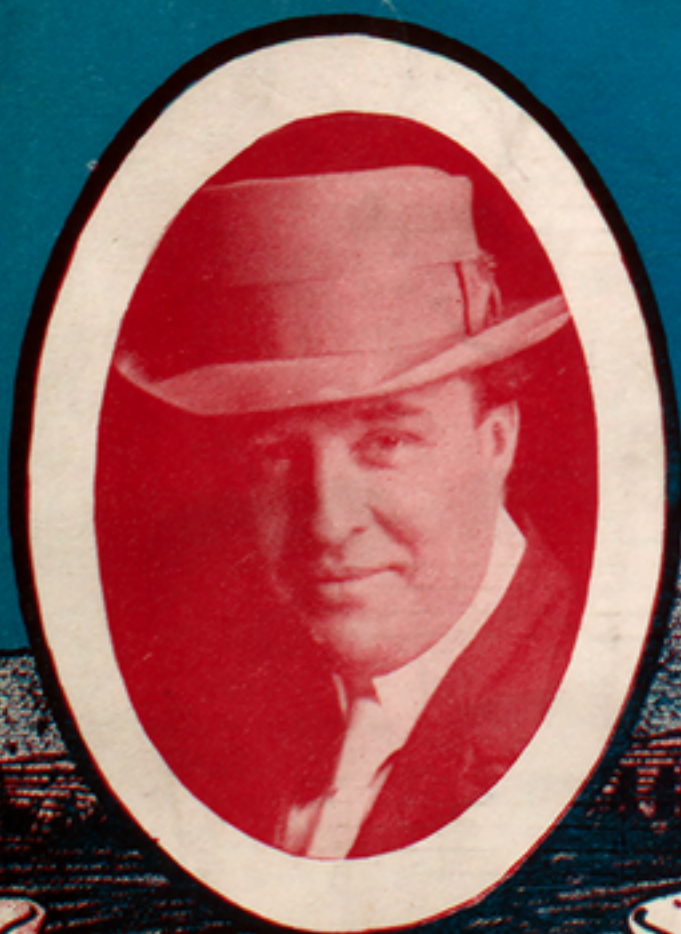
DEDICATED TO DICK FERRIS ORIGINATOR OF AVIATION MEET

WORDS BY CHAS. SAXBY MUSIC BY PHIL KAUFMAN