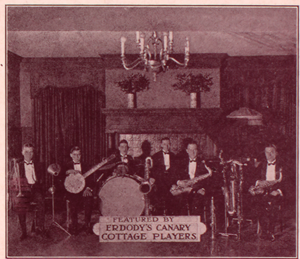
FEATURED BY ERDODY'S CANARY COTTAGE PLAYERS