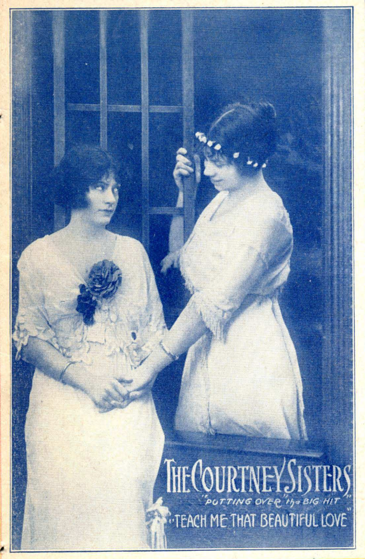
THE COURTNEY SISTERS "PUTTING OVER THE BIG HIT" "TEACH ME THAT BEAUTIFUL LOVE"