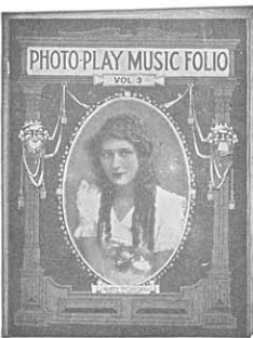
Photo-Play Music Folio

Each volume contains a large variety of Photo-Play Music for almost any occasion and the pieces are arranged in such a way that they may be repeated as often as desired.