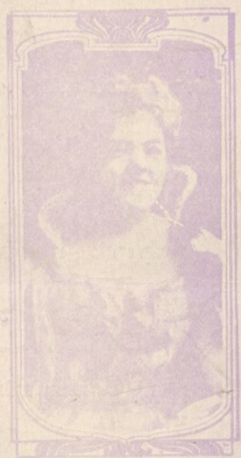
MISS MARIE CAHILL