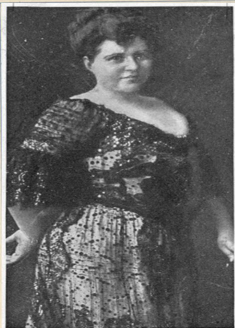
Ada Jones Comedienne

WORDS BY BILLY JOHNSON. MUSIC BY ALBERT VON TILZER.