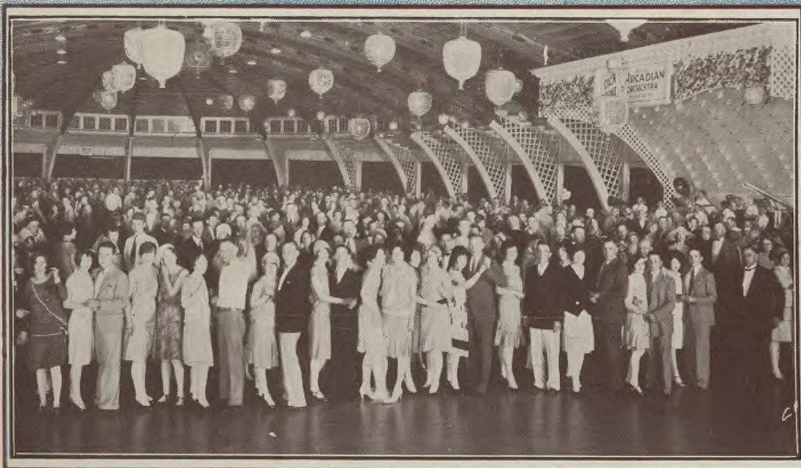
FEATURED AT FAIRYLAND PARK DANCE PALACE