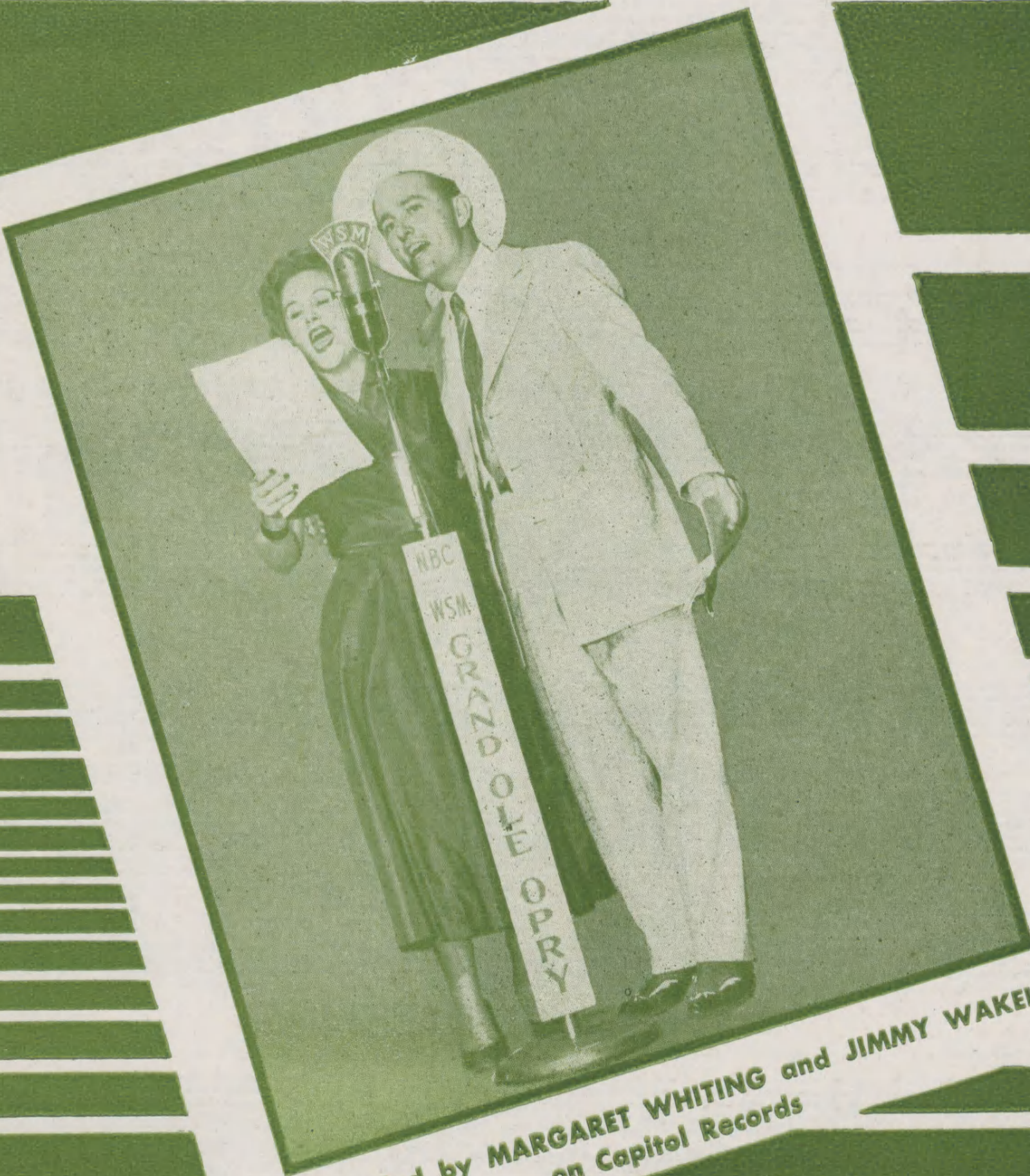
Recorded by MARGARET WHITING and JIMMY WAKELY on Capitol Records