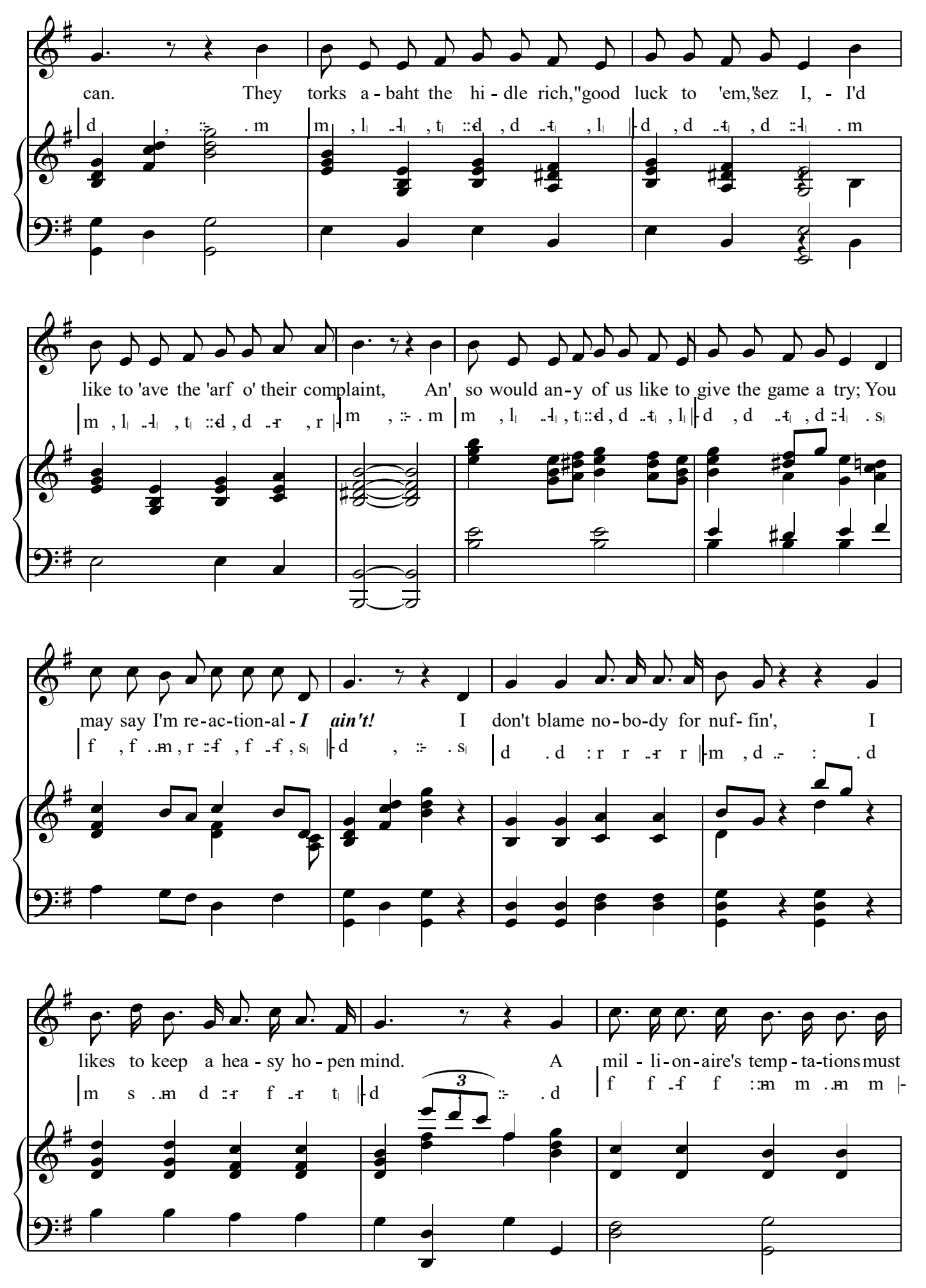
R & Co. 2743