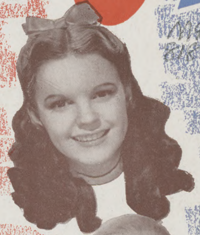
JUDY GARLAND as Dorothy