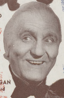
FRANK MORGAN as The Wizard