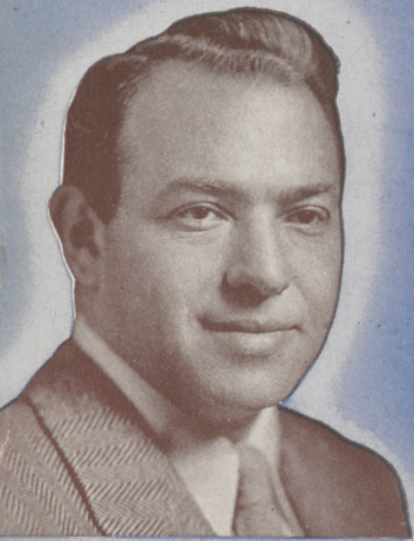
E. Y. HARBURG