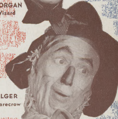
RAY BOLGER as The Scarecrow