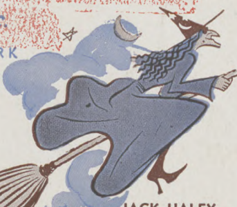
JACK HALEY as The Tin Woodman