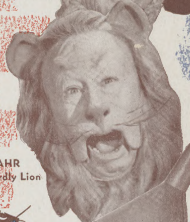
BERT LAHR as The Cowardly Lion