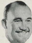
PAUL WHITEMAN Dean of modern American music.

To assist us in studying and selecting the 10 songs we will publish, these four world-famous personalities comprise our Advisory Board.