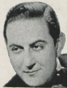
GUY LOMBARDO Top-ranking orchestra leader.