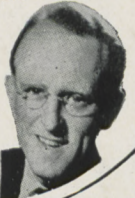
KAY KYSER Founder of the College of Musical Knowledge.

If you ever wanted to write a song but didn't know how to go about it—send for our Free illustrated folder. Mail this coupon—NOW!