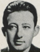
BILLY ROSE Broadway's leading producer.