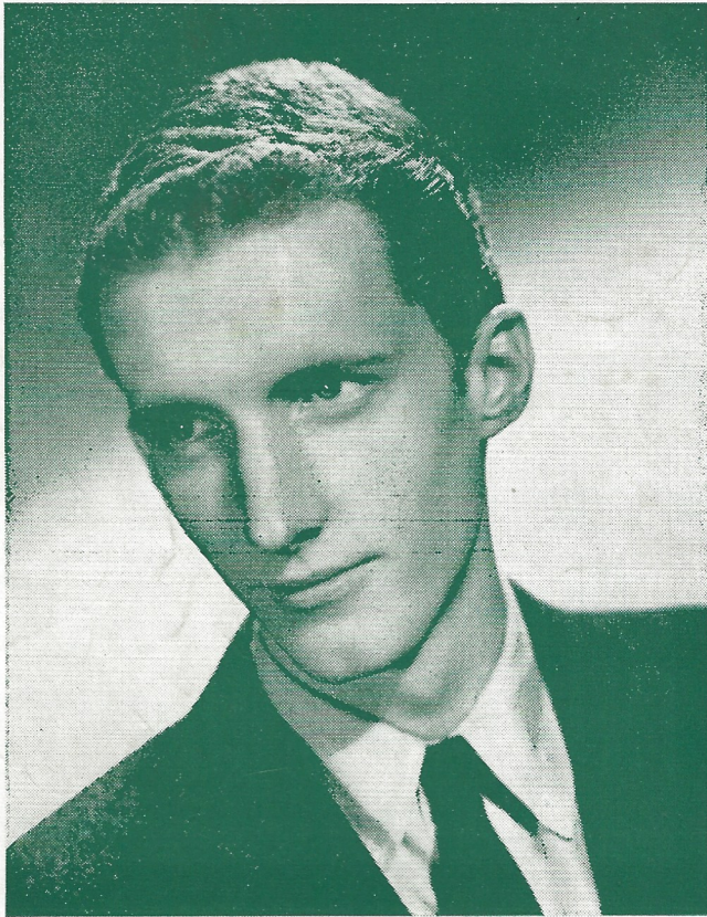
GEORGE HAMILTON IV