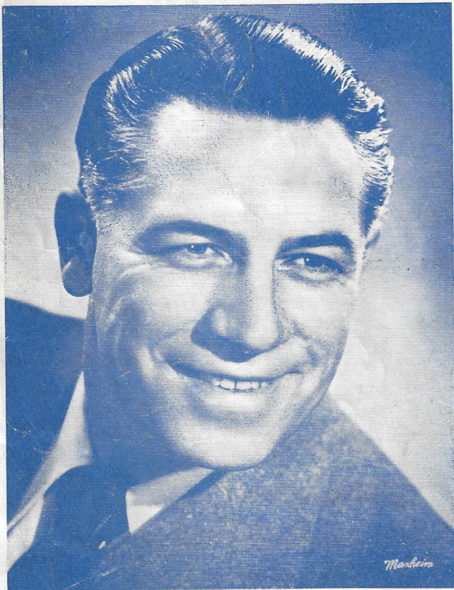
Featured by GEORGE BEVERLY SHEA Billy Graham Soloist on Victor Records