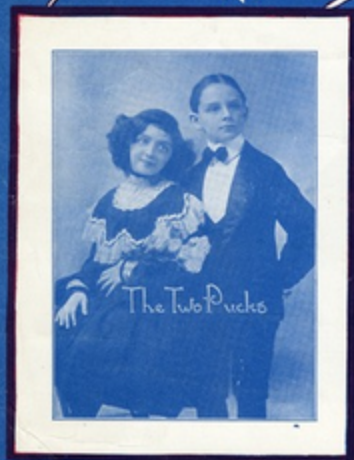
The Two Pucks