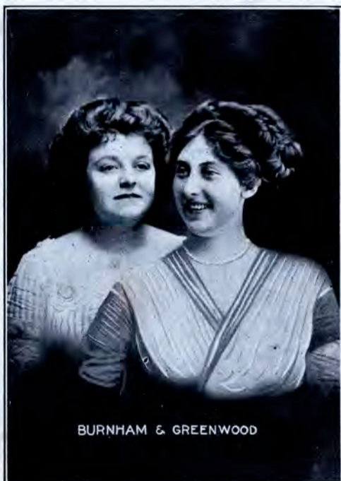
BURNHAM & GREENWOOD