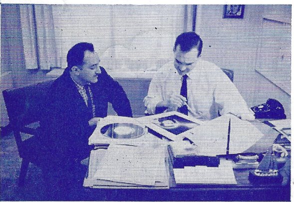
The sheet music cover, which deftly captures the mood of the music, is given finishing touches by artist Jack Cesareo and the publisher. The song is now ready for printing and distribution.