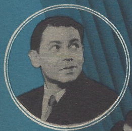
With OSCAR LEVANT