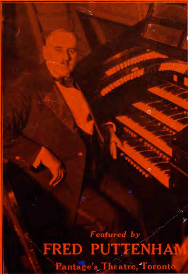
Featured by FRED PUTTENHAM Pantage's Theatre, Toronto