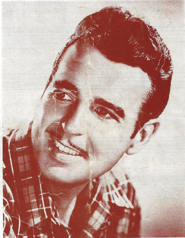
"TENNESSEE" ERNIE FORD

RECORDED BY "TENNESSEE" ERNIE FORD ON CAPITOL RECORDS