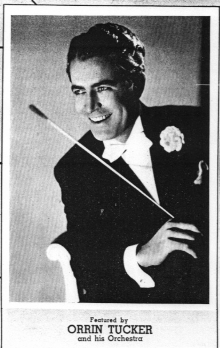
Featured by ORRIN TUCKER and his Orchestra