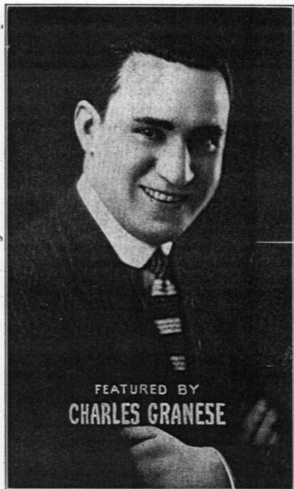
FEATURED BY CHARLES GRANESE