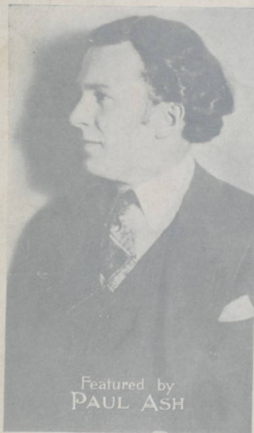
Featured by PAUL ASH